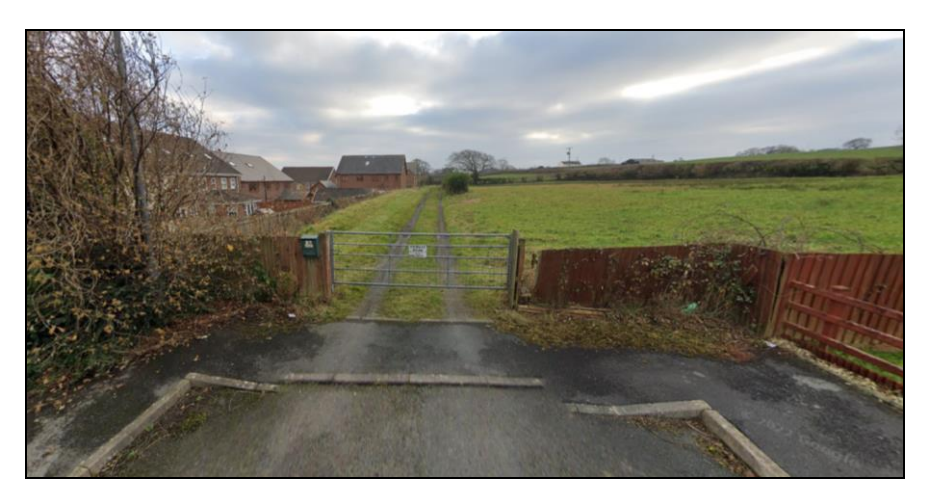
Photograph 2 (Streetscene of Aber Llwchwr)

Access to the allocation is currently gained off Aber Llwchwr, that leads to an agricultural access point to the site (see below).