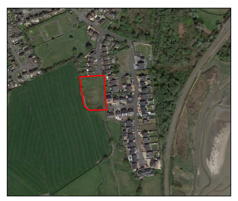
Photograph 1 (Extract from Google Earth – June 2021)

Access to the allocation is currently gained off Aber Llwchwr, that leads to an agricultural access point to the site (see below).