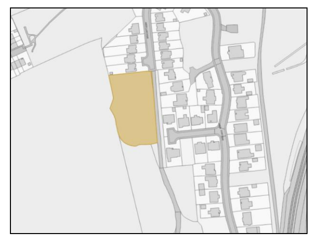
Plan A (Extract of Proposals Map for Box Farm Allocation)

As part of the current consultation process into the 2<sup>nd</sup> Deposit LDP, the Council have again published a "Site Assessment Table" (2023), which provides details of the Council's analysis of each received Candidate Site submission and existing allocations within the current adopted LDP. Proposed allocation SeC7/h1 was considered as part of this process and as a result the Council concluded as follows: