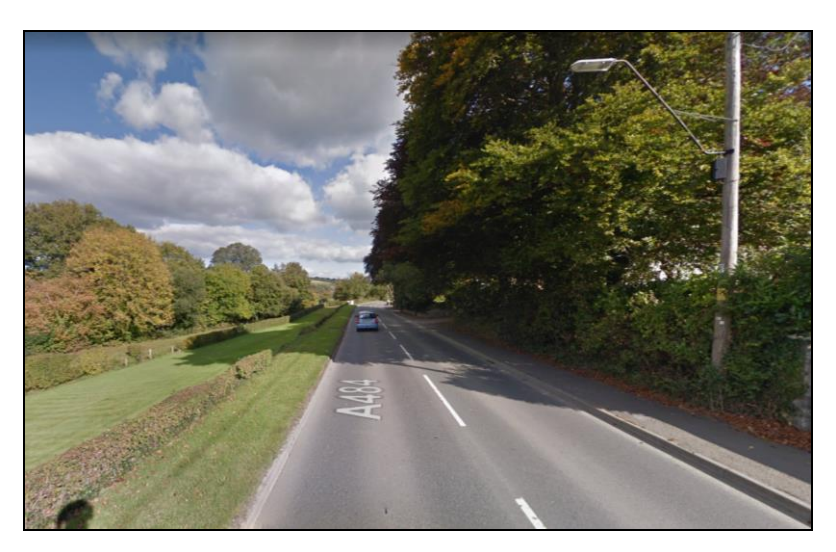
Photograph 2 (streetscene of A484)

Access to the allocation is currently gained via a rear access track (south of the allocation site). However, the western boundary of the allocation also borders the A484 (see below).