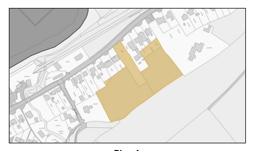
Plan A (Extract of Proposal Map for Newcastle Emlyn and Land to r/o Dolcoed Allocation)

As part of the current consultation process into the 2<sup>nd</sup> Deposit LDP, the Council have again published a "Site Assessment Table" (2023), which provides details of the Council's analysis of each received Candidate Site submission and existing allocations within the current adopted LDP. Proposed allocation SeC12/h3 was considered as part of this process and as a result the Council concluded as follows: