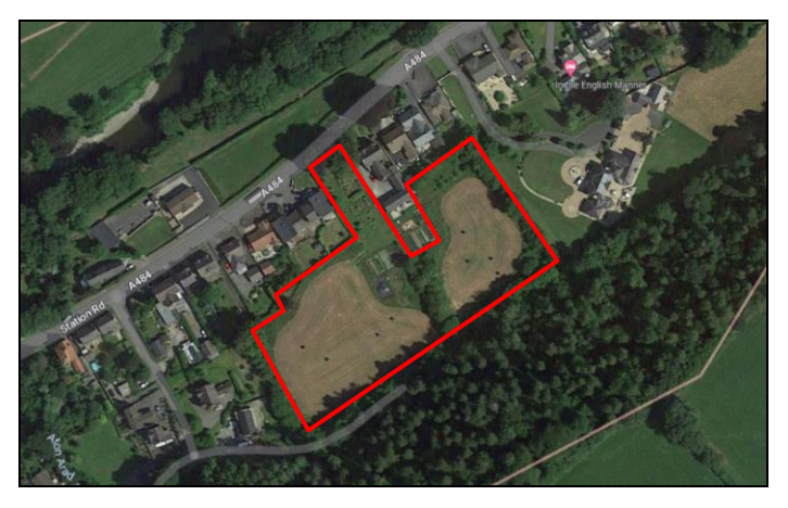
Photograph 1

Access to the allocation is currently gained via a rear access track (south of the allocation site). However, the western boundary of the allocation also borders the A484 (see below).