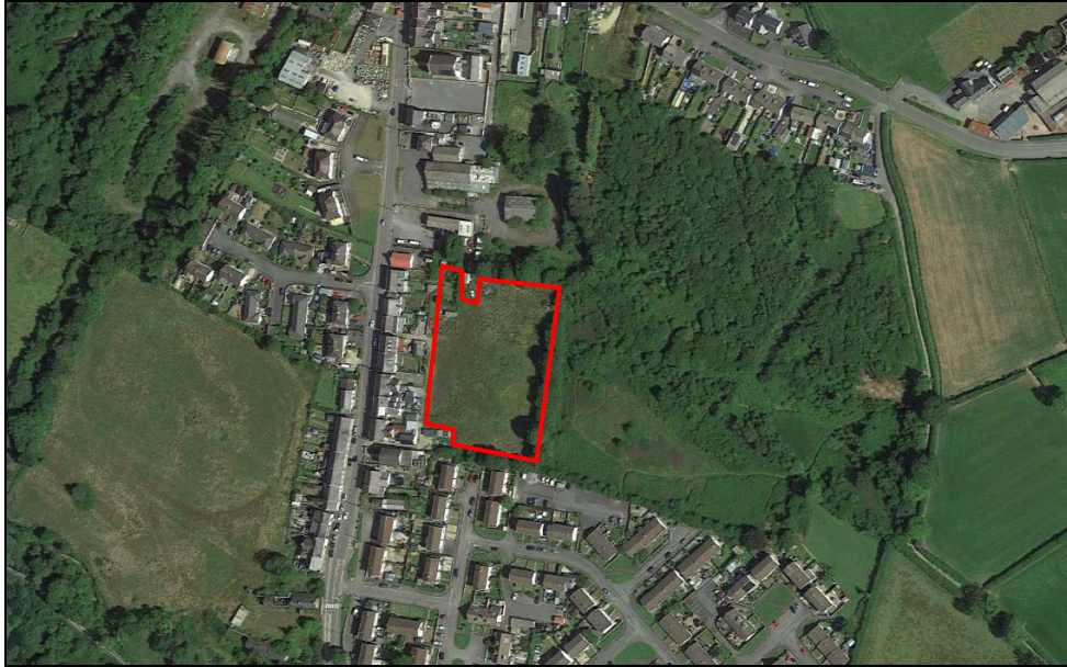
Photograph 1

Access to the allocation is currently gained via the B4459, that being the main road running north to south through Pencader (see below).