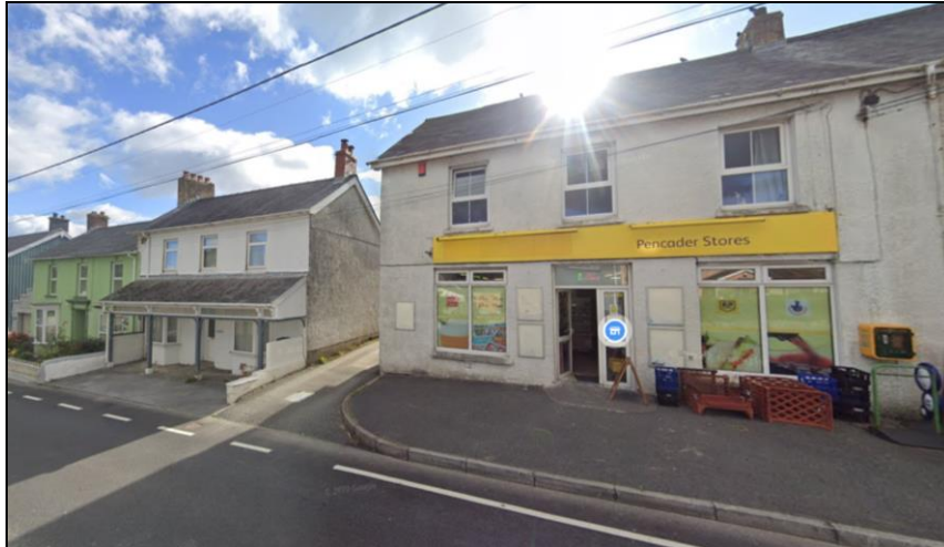
Photograph 2 (Streetscene of B4459)

Access to the allocation is currently gained via the B4459, that being the main road running north to south through Pencader (see below).