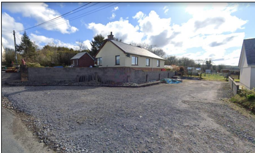
Photograph 2 (Streetscene of the U5450)

Access to the allocation is currently gained via an existing agricultural access point along the U5450, that being the main road running through Capel Iwan (see below).