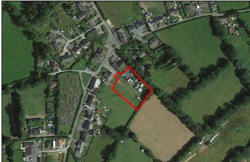
Photograph 1 (Extract from Google Earth – June 2021)

Access to the allocation is currently gained via an existing agricultural access point along the U5450, that being the main road running through Capel Iwan (see below).