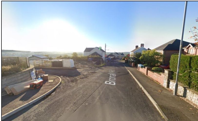
Photograph 2 (Streetscene of Bronallt Road)

Access to the allocation is currently gained off Bronallt Road, that being a residential street running north to south through Hendy (see below).