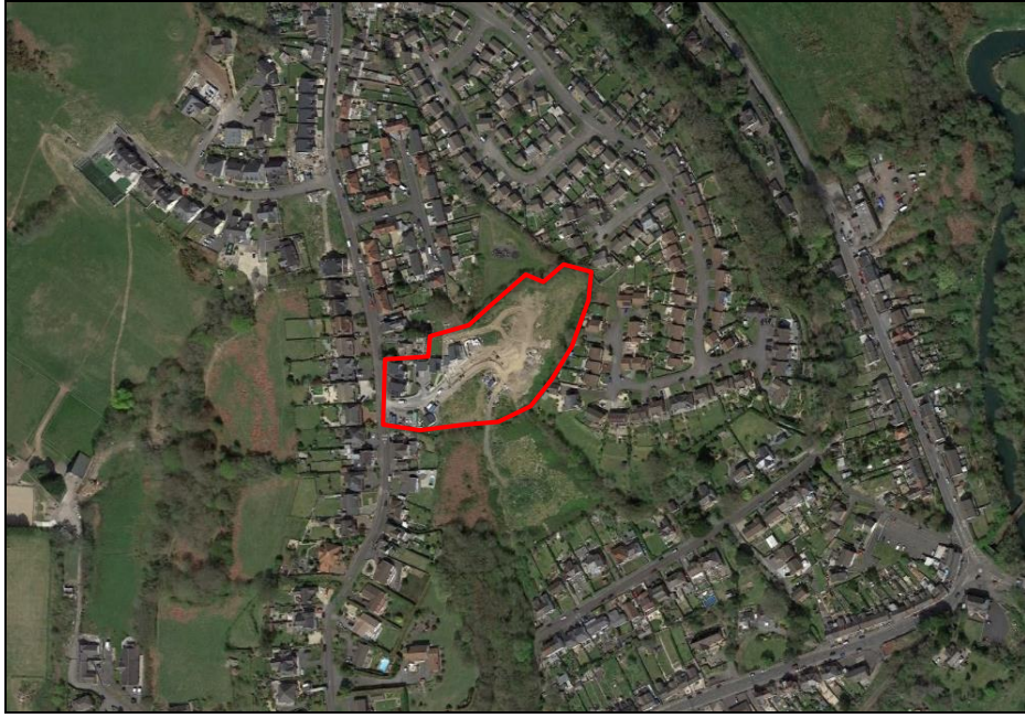
Photograph 1

Access to the allocation is currently gained off Bronallt Road, that being a residential street running north to south through Hendy (see below).