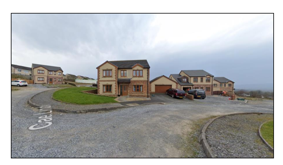
Photograph 2 (Streetscene of Cae Linda)

Access to the allocation is currently gained off Cae Linda, that being a residential street as cam be seen below.