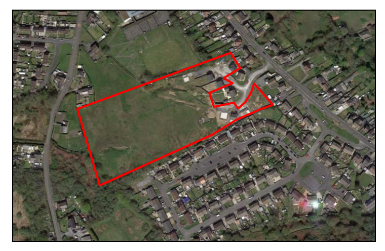
Photograph 1

Access to the allocation is currently gained off Cae Linda, that being a residential street as cam be seen below.