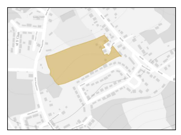
Plan A (Extract of Proposals Map for Cae Linda Allocation)

As part of the current consultation process into the 2<sup>nd</sup> Deposit LDP, the Council have again published a "Site Assessment Table" (2023), which provides details of the Council's analysis of each received Candidate Site submission and existing allocations within the current adopted LDP. Proposed allocation SeC8/h2 was considered as part of this process and as a result the Council concluded as follows: