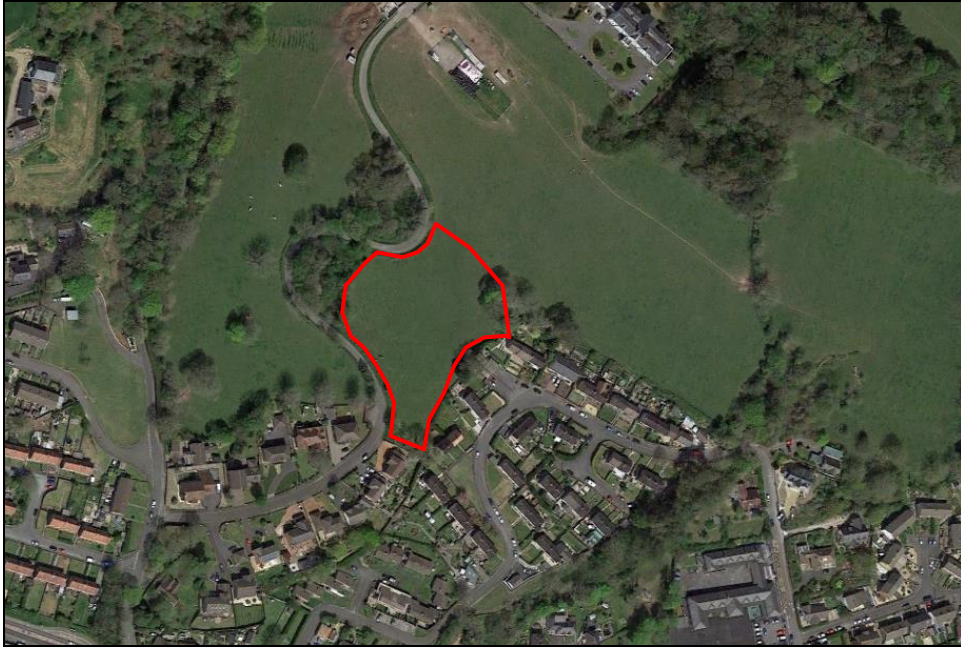
Photograph 1 (Extract from Google Earth – June 2021)

Access to the allocation is currently unknown, however, the western perimeter borders Beech Grove (see below).