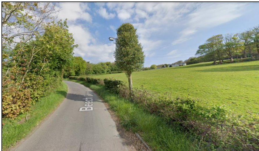
Photograph 2 (Streetscene of Beech Grove)

Access to the allocation is currently unknown, however, the western perimeter borders Beech Grove (see below).