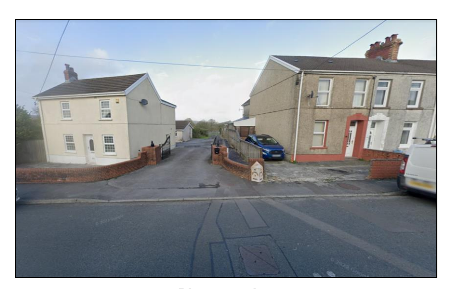
Photograph 2 (Streetscene of Heol Llanelli)

Access to the allocation is currently gained off an existing access point off Heol Llanelli, that being the amin road running through Pontyates (see below).