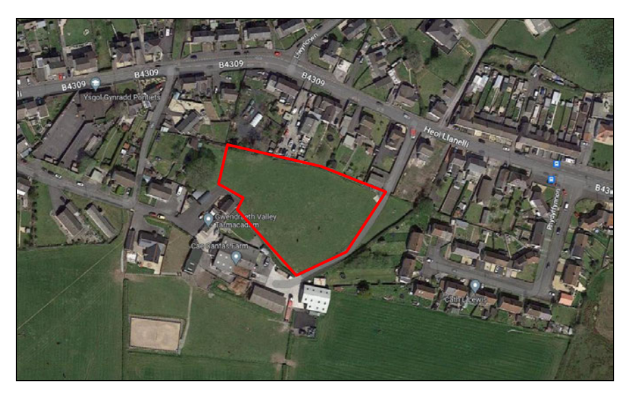
Photograph 1

Access to the allocation is currently gained off an existing access point off Heol Llanelli, that being the amin road running through Pontyates (see below).