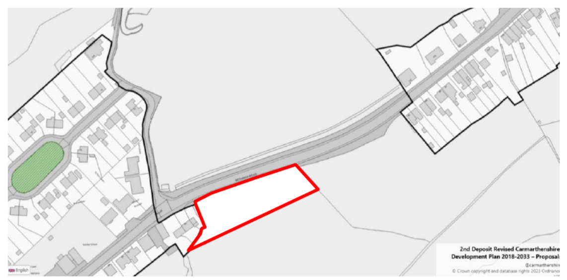
Figure 3 – Extract from Proposals Map with Representation site edged in red

Specifically, our clients consider that the draft settlement limits for Upper Tumble, as defined under Policy SD1 "Settlement Limits", should be amended to include the land as edged in red upon the extract of the Proposals Map for Upper Tumble, as reproduced below in Figure 3. The land should be appropriately allocated for Housing under Policy HOM1.