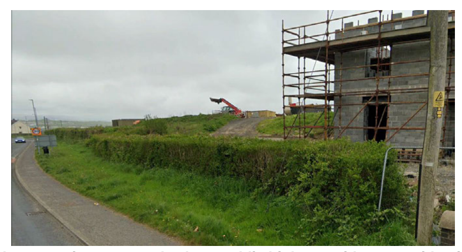
Photo 2 – view eastwards along public highway with new residential construction evident and immediately adjoining the Representation Site