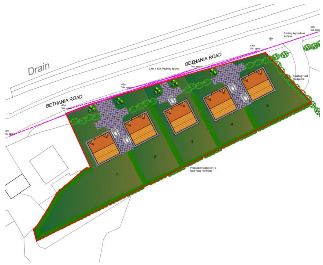
Figure 5 – Indicative Site Layout Proposals

2.2 The Representation proposals would ensure that massing of scale was sensitively designed with buildings not rising to more than two storeys. The development of the field frontage will necessitate partial re-modelling of ground levels of the field when forming access driveways. However, the footprints of the proposed dwellings themselves would be sited upon a plateau in the enclosure, so that new development would correspond to the ground levels of adjoining Tirlan Farm properties, as shown in the photographs below.