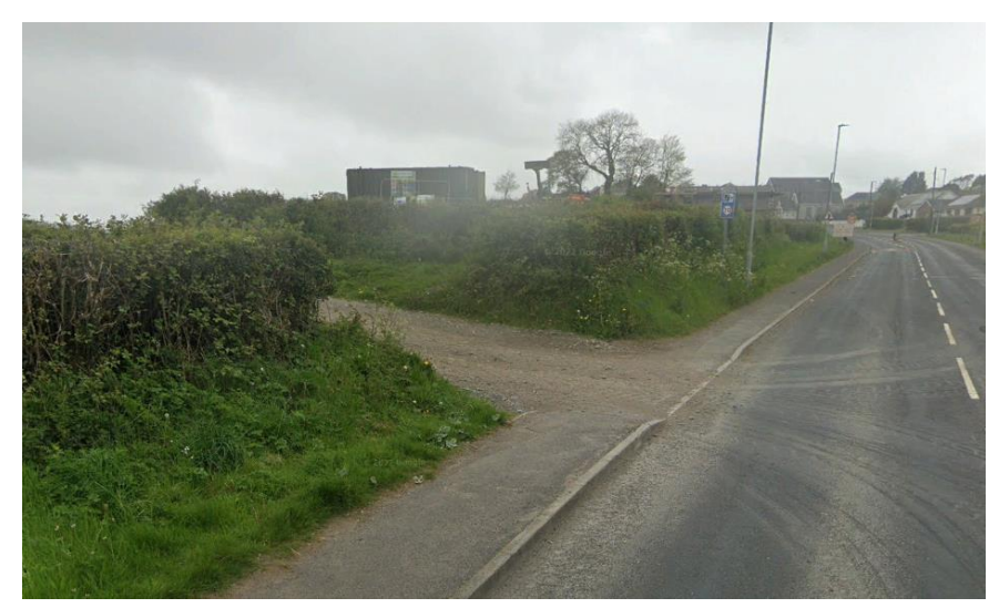
Photo 1 – view looking west along Bethania Road with field frontage to left and established agricultural access to the farm holding

2.2 The Representation proposals would ensure that massing of scale was sensitively designed with buildings not rising to more than two storeys. The development of the field frontage will necessitate partial re-modelling of ground levels of the field when forming access driveways. However, the footprints of the proposed dwellings themselves would be sited upon a plateau in the enclosure, so that new development would correspond to the ground levels of adjoining Tirlan Farm properties, as shown in the photographs below.