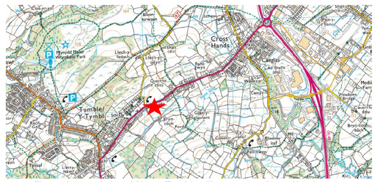
Figure 6 – proximity of Site to Tumble village centre, Cross Hands town centre and major road network

The red star denotes the position of the Representation Site.