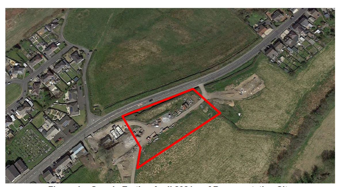
Figure 1 - Google Earth - April 2021 - of Representation Site

The Site comprises a single rectangular-shaped field frontage, and generally level to gently sloping grazing field set off the immediate southern flank of Bethania Road. The field is marked by a roadside hedgerow which extends the field length, but is punctured by an agricultural access gateway, from where an unmade farm track leads off to a recently completed agricultural outbuilding set in the eastern field of Tirlan. The Representation Site is currently being used as a contractors' storage area as the four houses at Tirlan are being constructed. Figure 1 below provides a Google Earth image of the site, whilst Figure 2 provides a detailed Ordnance Survey map extract of the site.