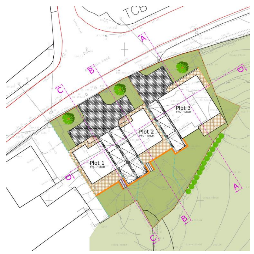
Figure 4 – redevelopment of Tirlan Farmyard curently under construction