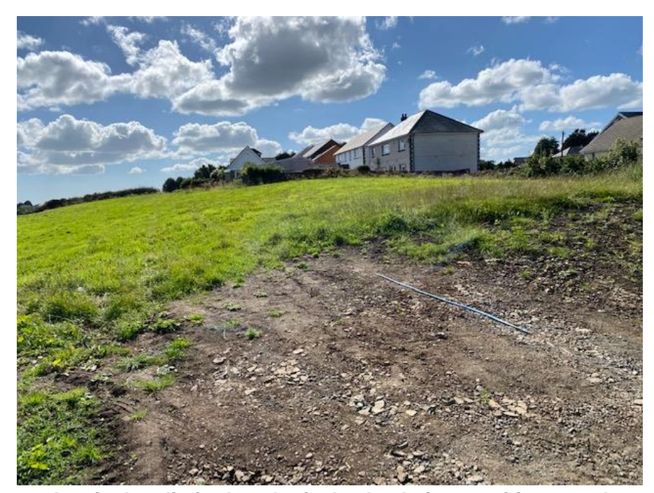
Photo 3 – the site has limited ecological value being semi-improved grassland