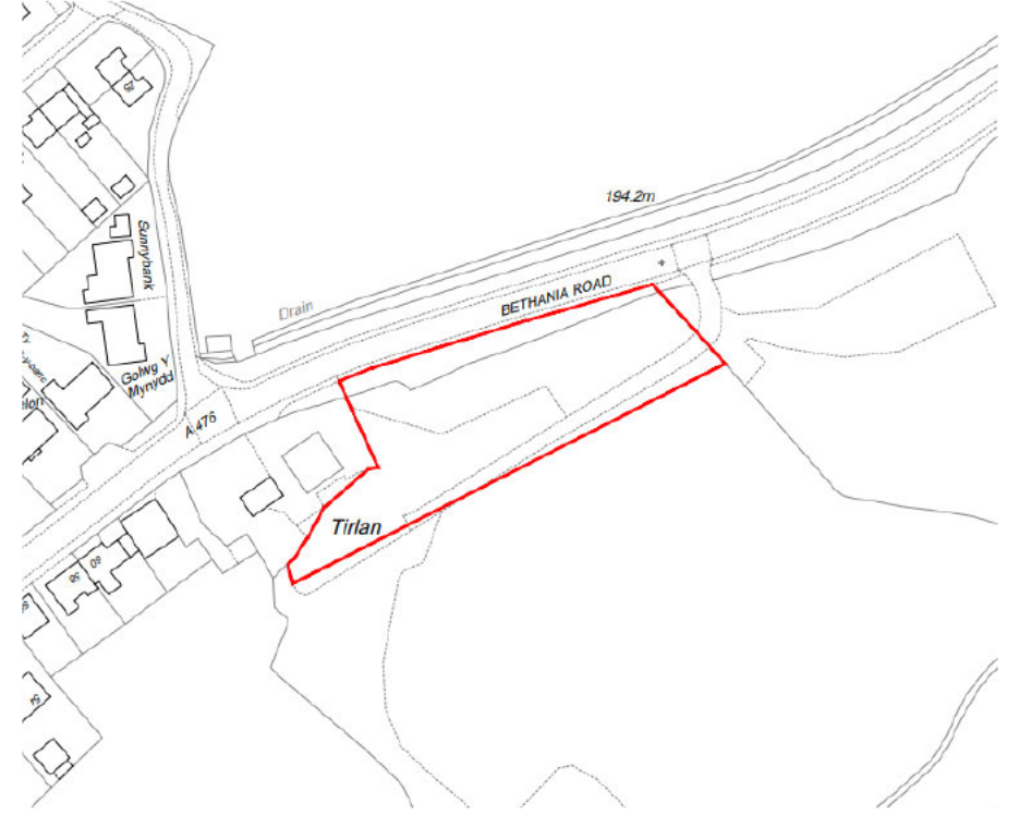
Figure 2 – Ordnance Survey Map extract of Representation Site