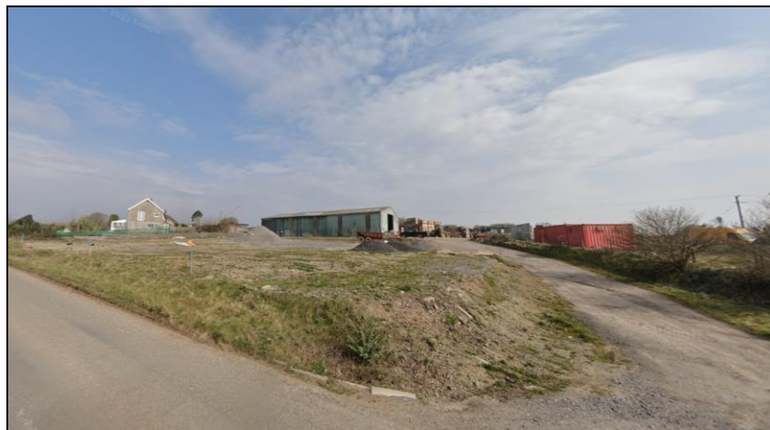
Photograph 2 (Streetscene of B4314)

Access to the allocation is currently gained via the B4314, that being the main road running north into the Village of Pendine (see below).