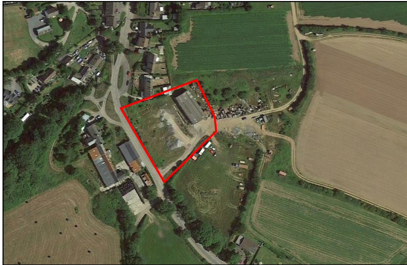
Photograph 1 (Extract from Google Earth – June 2021)

dominated by a large, metal shed and what seems to be a storage yard, as can be seen from the aerial photograph below (outlined in red below).