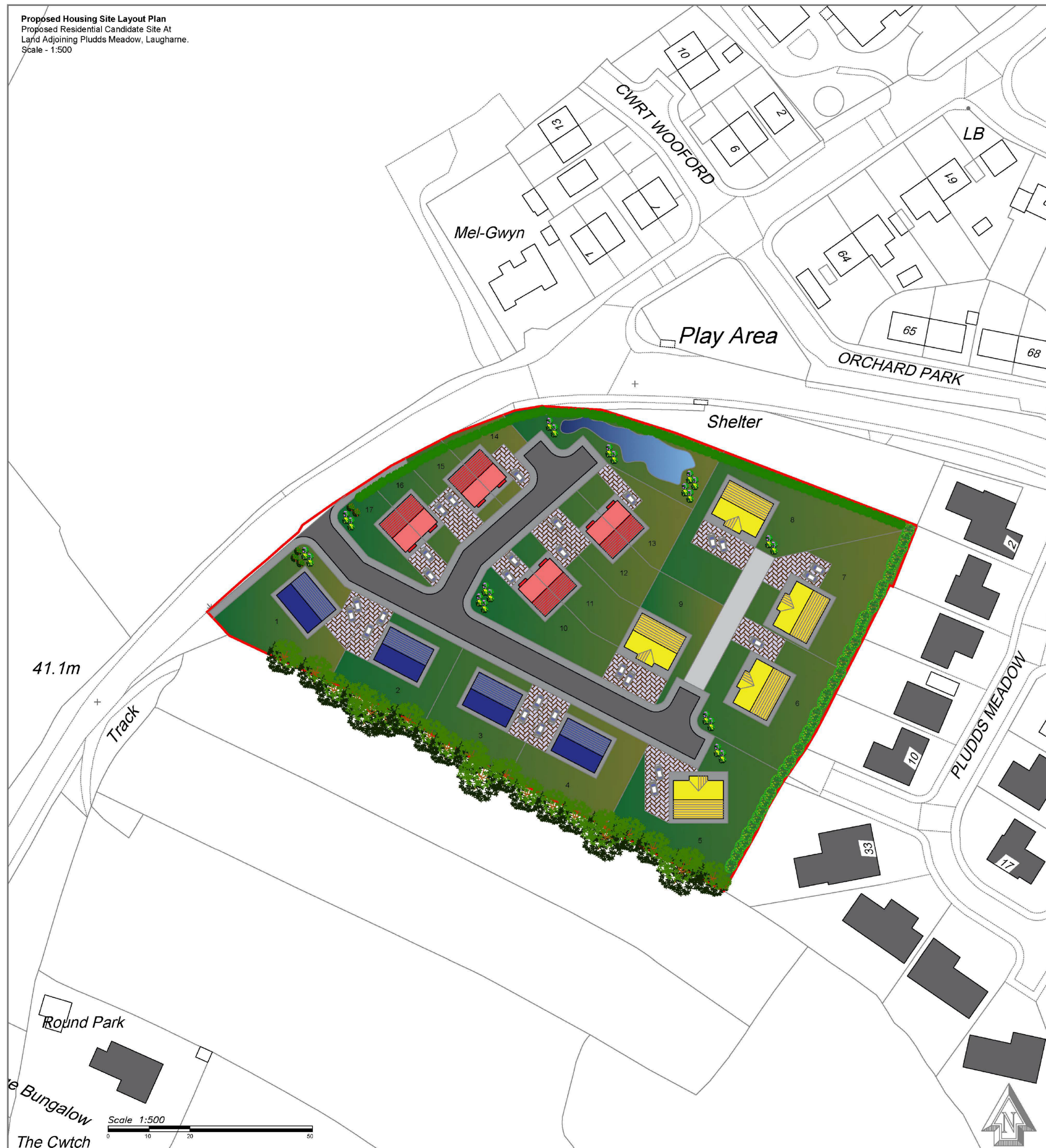
Proposed Housing Site Layout Plan Proposed Residential Candidate Site At Land Adjoining Pludds Meadow, Laugharne. Scale - 1:500