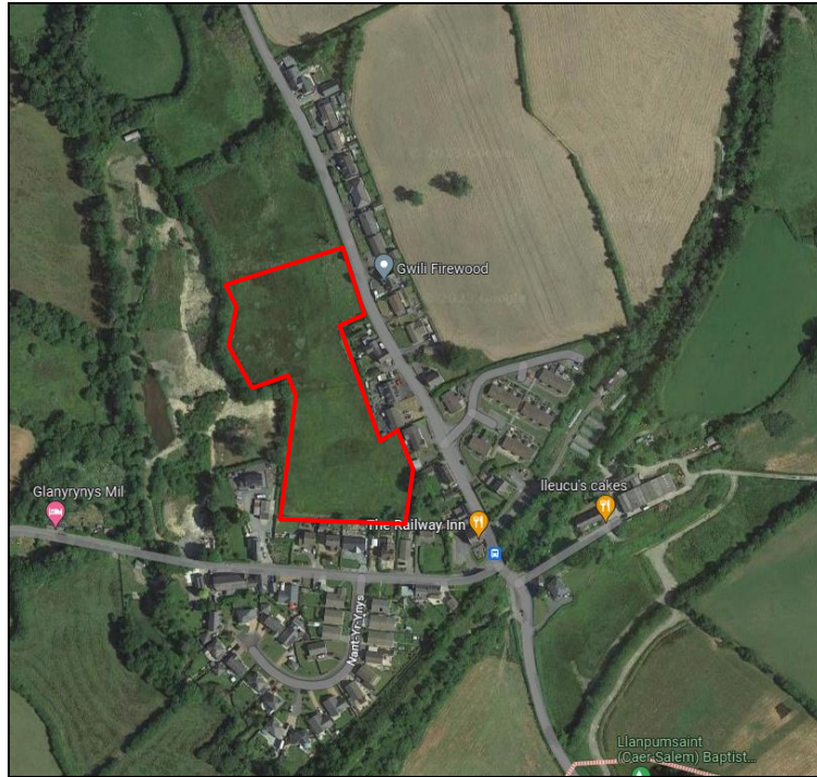
Photograph 1 (Extract from Google Earth – June 2021)

Access to the allocation is currently unknown, however, the eastern perimeter borders the C1301, that being the main road running through Llanpumsaint (see below).