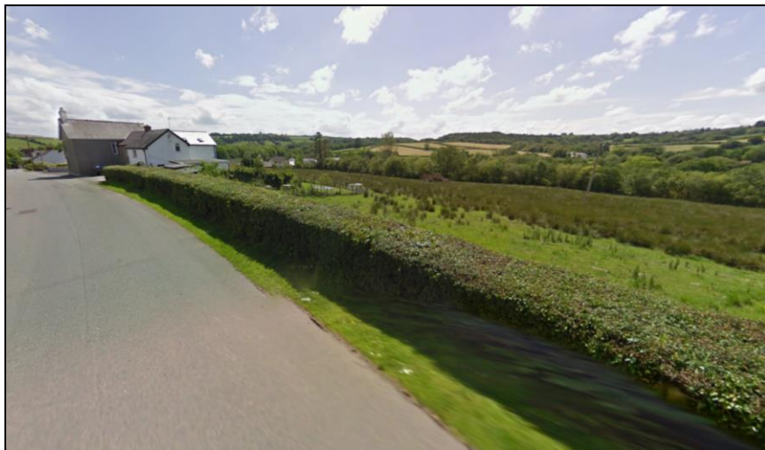
Photograph 2 (Streetscene of C1301)

Access to the allocation is currently unknown, however, the eastern perimeter borders the C1301, that being the main road running through Llanpumsaint (see below).