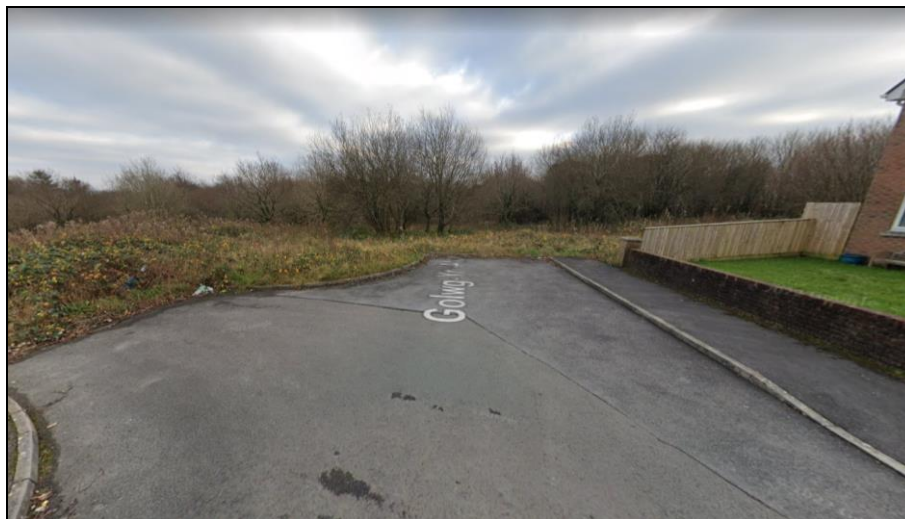
Photograph 2 (Streetscene of Aber Llchwyr)

Access to the allocation is currently unknown, however, the site adjoins Golwg yr Afon that being a residential site west of the allocation (see below).