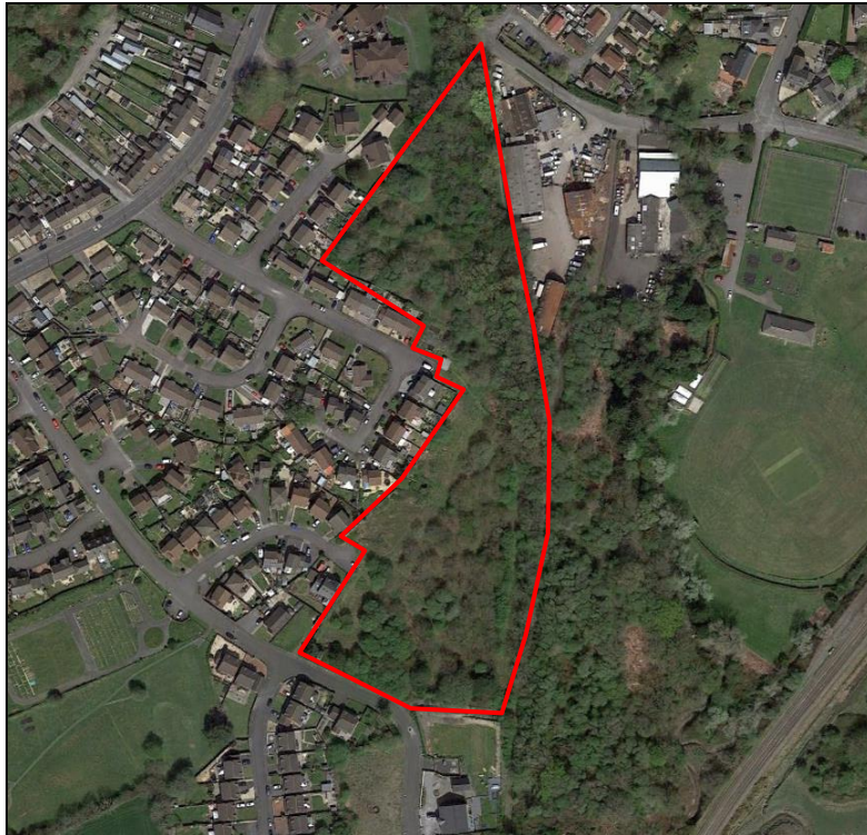
Photograph 1

Access to the allocation is currently unknown, however, the site adjoins Golwg yr Afon that being a residential site west of the allocation (see below).