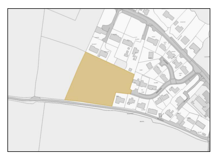
Plan A (Extract of Proposal Map for Newcastle Emlyn and Trem y Ddol Allocation)

As part of the current consultation process into the 2<sup>nd</sup> Deposit LDP, the Council have again published a "Site Assessment Table" (2023), which provides details of the Council's analysis of each received Candidate Site submission and existing allocations within the current adopted LDP. Proposed allocation SeC12/h1 was considered as part of this process and as a result the Council concluded as follows: