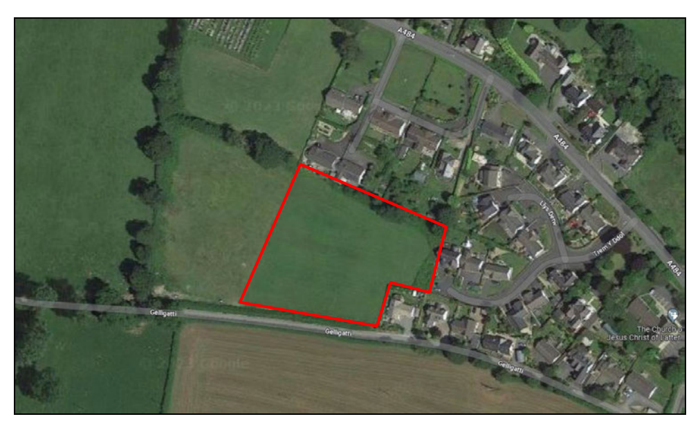
Photograph 1 (Extract from Google Earth – June 2021)

Access to the site is currently gained via Trem y Ddol (see below), that being a residential site located to the eat of the allocation.