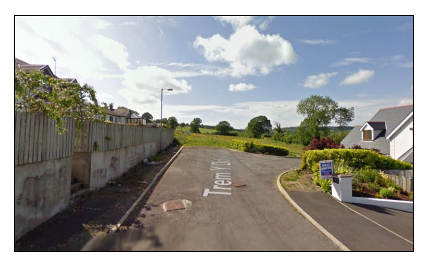
Photograph 2 (streetscene of Ffordd y Glowyr)

Access to the site is currently gained via Trem y Ddol (see below), that being a residential site located to the eat of the allocation.