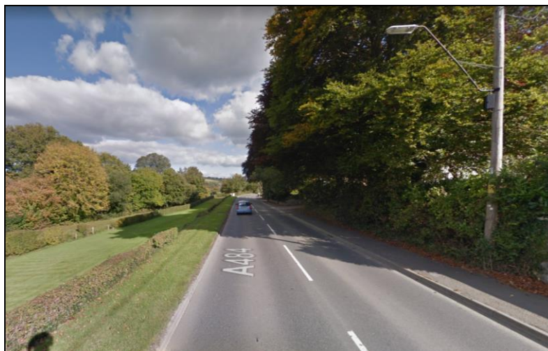
Photograph 2 (streetscene of A484)

Access to the allocation is currently gained via a rear access track (south of the allocation site). However, the western boundary of the allocation also borders the A484 (see below).