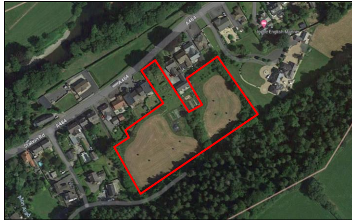
Photograph 1 (Extract from Google Earth – June 2021)

Access to the allocation is currently gained via a rear access track (south of the allocation site). However, the western boundary of the allocation also borders the A484 (see below).