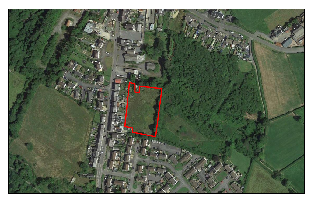
Photograph 1 (Extract from Google Earth – June 2021)

Access to the allocation is currently gained via the B4459, that being the main road running north to south through Pencader (see below).