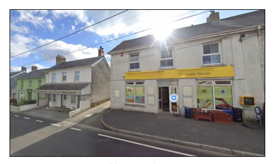
Photograph 2 (Streetscene of B4459)

Access to the allocation is currently gained via the B4459, that being the main road running north to south through Pencader (see below).