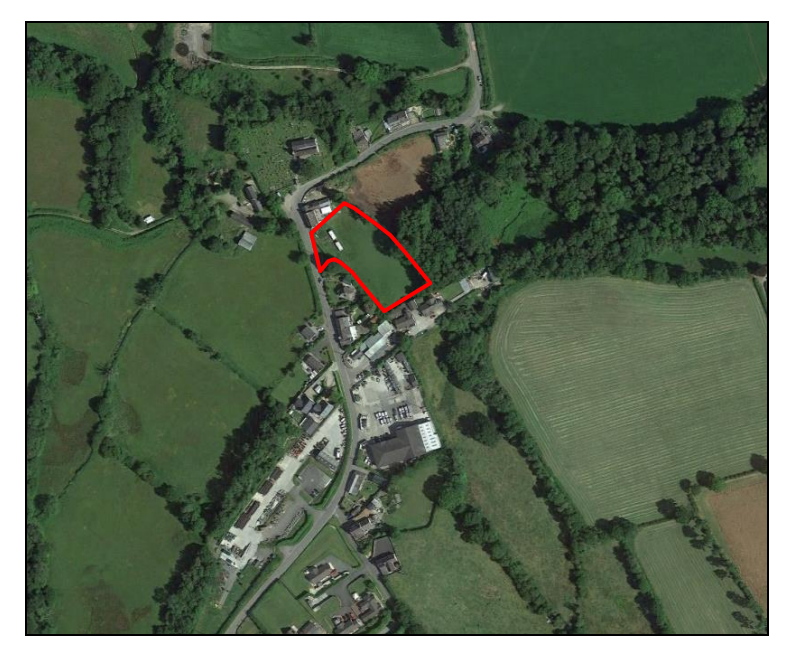
Photograph 1 (Extract from Google Earth – June 2021)

Access to the allocation is currently gained via an existing agricultural access point along the B4459, that being the main road running through the village (see below).