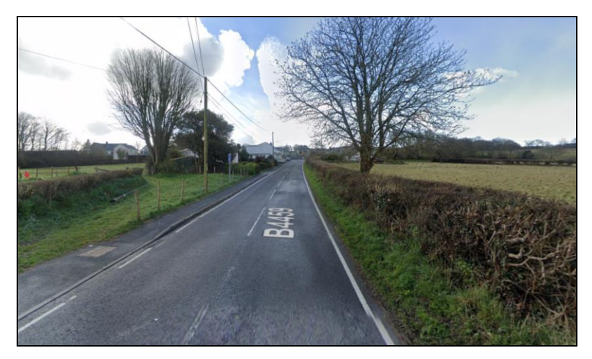
Photograph 2 (Streetscene of the B4459)

Access to the allocation is currently gained via an existing agricultural access point along the B4459, that being the main road running through the village (see below).