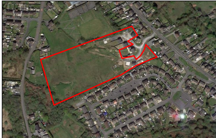
Photograph 1

Access to the allocation is currently gained off Cae Linda, that being a residential street as can be seen below.