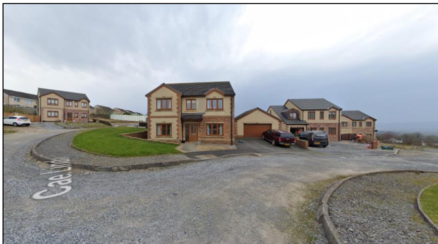
Photograph 2 (Streetscene of Cae Linda)

Access to the allocation is currently gained off Cae Linda, that being a residential street as can be seen below.