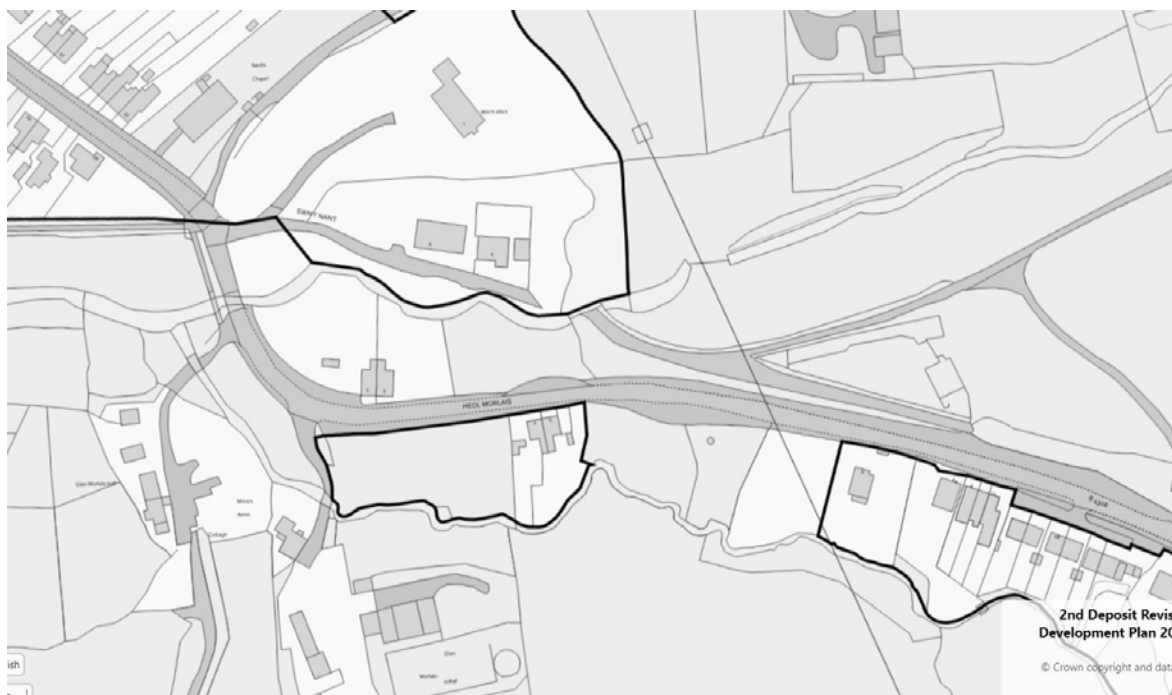
Plan B – Extract from part of the Proposals Map for Trimsaran

Plan B represents an extract of the Second Deposit LDP Proposals Map for Trimsaran, clearly now identifying our client's field frontage as land within the defined settlement limits: