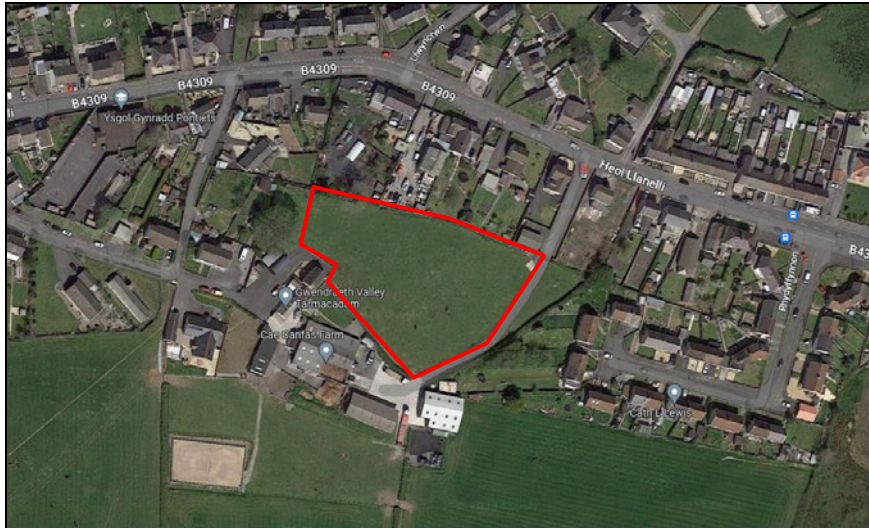
Photograph 1 (Extract from Google Earth – June 2021)

Access to the allocation is currently gained off an existing access point off Heol Llanelli, that being the amin road running through Pontyates (see below).