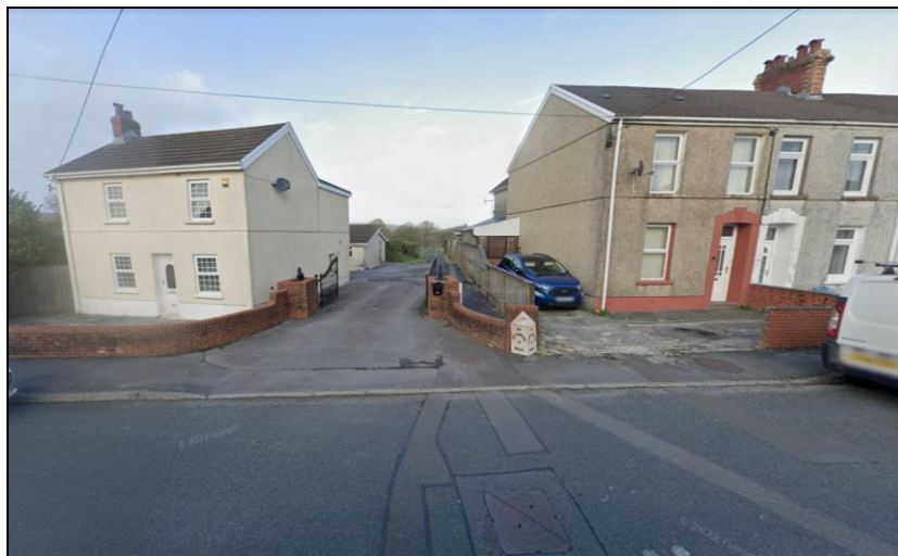
Photograph 2 (Streetscene of Heol Llanelli)

Access to the allocation is currently gained off an existing access point off Heol Llanelli, that being the amin road running through Pontyates (see below).