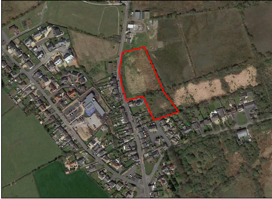
Photograph 1 (Extract from Google Earth – June 2021)

Access to the allocation is currently unknown, however as previously mentioned, the western border of the allocation borders the B4309, that being the main road running through Five Roads as can be seen below.