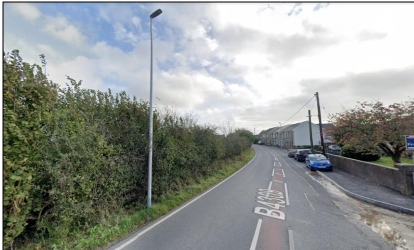
Photograph 2 (Streetscene of B4309)

Access to the allocation is currently unknown, however as previously mentioned, the western border of the allocation borders the B4309, that being the main road running through Five Roads as can be seen below.