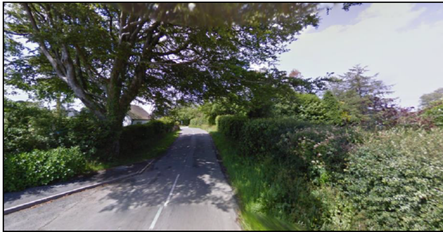
Photograph 2 (Streetscene of Drefach Road)

Access to the allocation is currently gained via the College Bach (north of the allocation site), via the property's entrance. However, the western boundary of the allocation also borders the C2081 (see below).