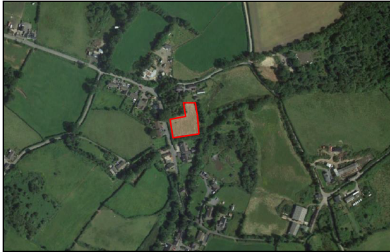
Photograph 1 (Extract from Google Earth – June 2021)

Access to the allocation is currently gained via the College Bach (north of the allocation site), via the property's entrance. However, the western boundary of the allocation also borders the C2081 (see below).