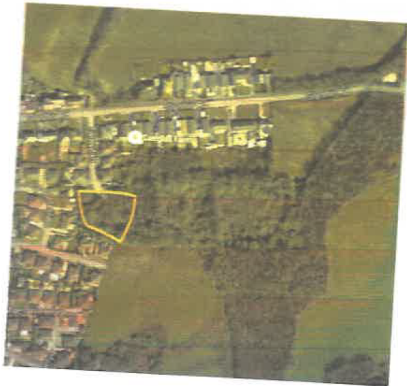
Fig 3 Site area option 1

LOCAL POSTCODE SA15 2TJ ADJACENT TO TAN Y LAN, LLADYBIE CARMARTHEN