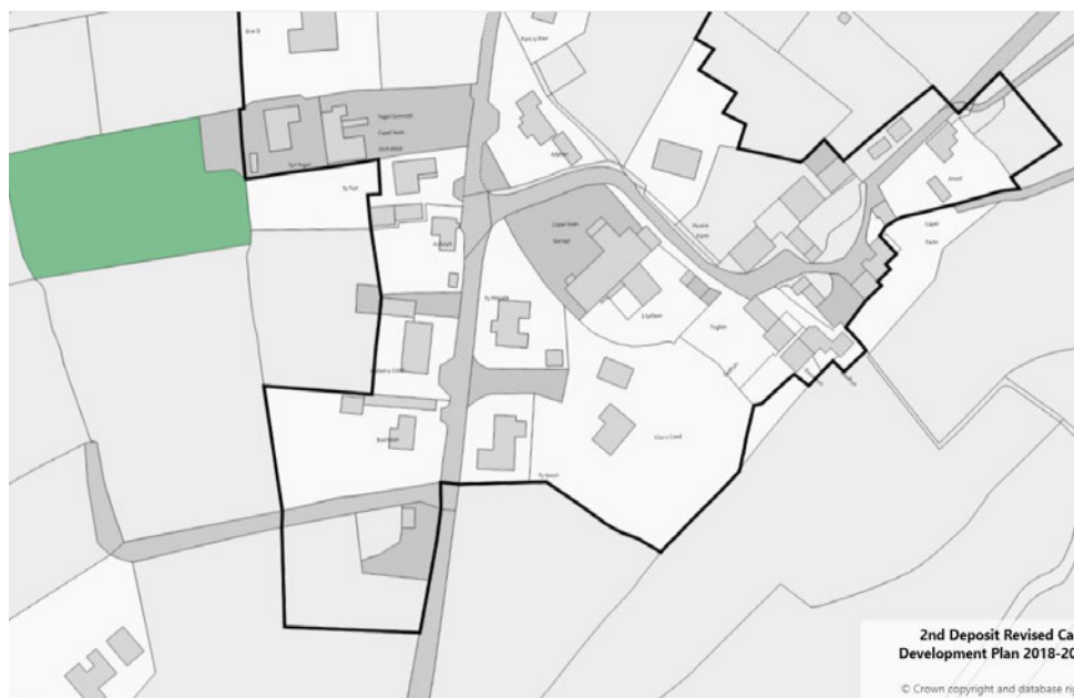
Plan B – Extract from part of the Proposals Map for Capel Iwan

Plan B represents an extract of the Second Deposit LDP Proposals Map for Capel Iwan, clearly now identifying our clients' field frontage as land within the defined settlement limits: