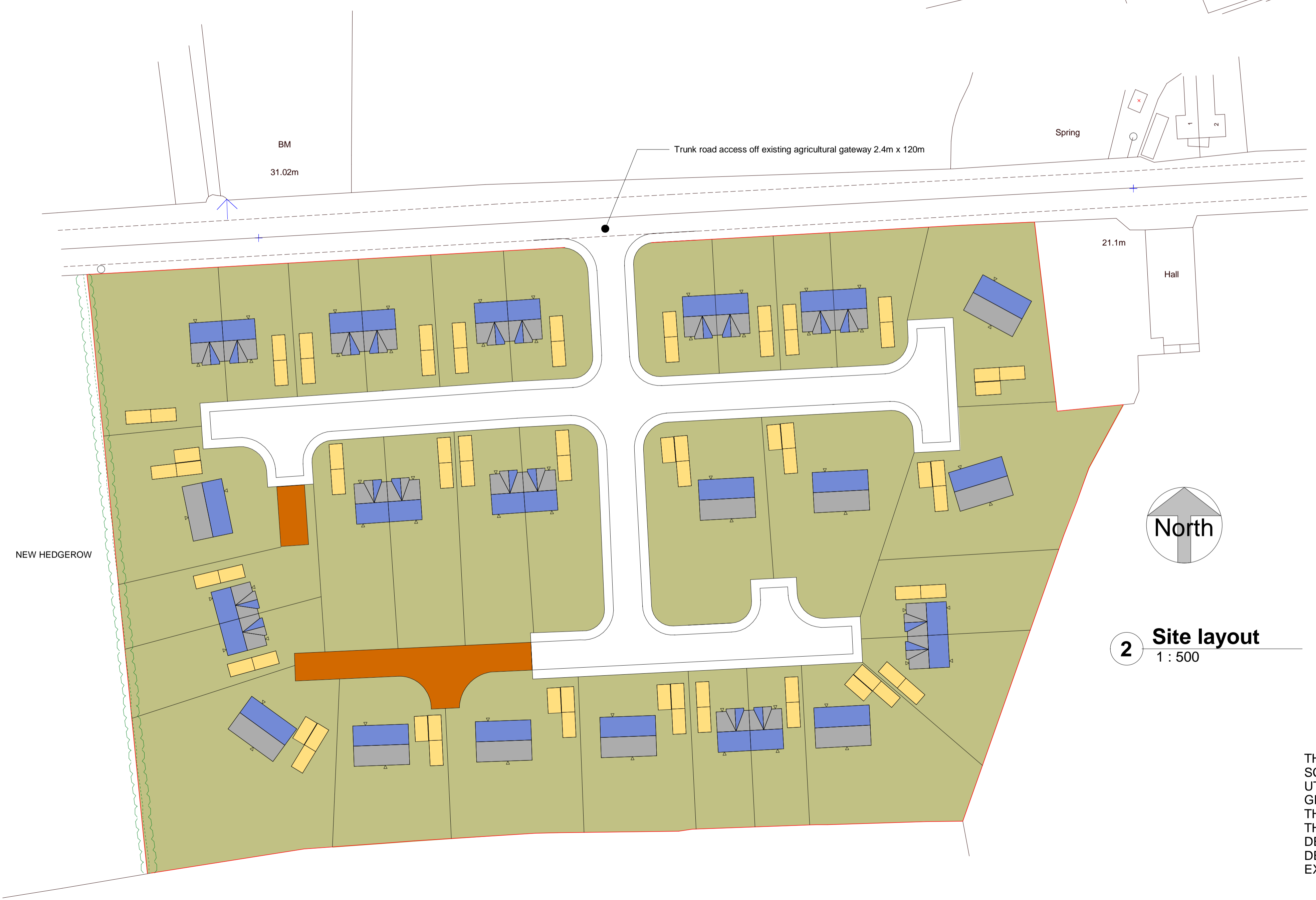
2 Site layout 1 : 500

Map reference SN50197 21661 Site area 2.127 HA